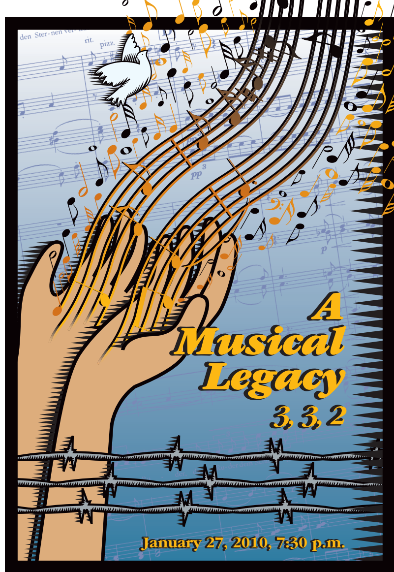
Illustration and design by Photonics Graphics

American Jewish Committee Jewish Community Relations Council of Cincinnati Munich Sister City Association of Greater Cincinnati Consul General of the Federal Republic of Germany