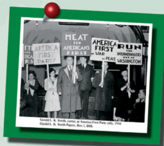
Gerald L. K. Smith, center, at America First Party rally, 1941